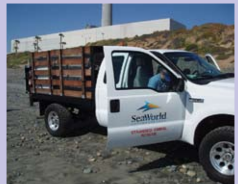
Sea World Animal Rescue

Recently, NRG employees worked with Sea World to rescue a seal that was in distress on the beach in front of the power plant.