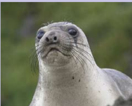
A seal was saved at Aqua Hedionda Lagoon

Recently, NRG employees worked with Sea World to rescue a seal that was in distress on the beach in front of the power plant.